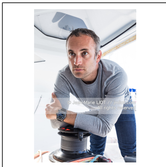
French solo sailor Fabrice Amedeo with Breitling watches, onboard his IMOCA Newrest-Arts & Fenetres, in Quiberon Bay on April 18, 2018