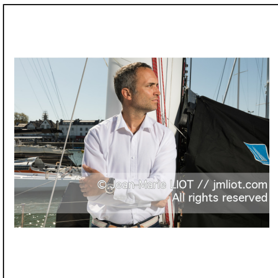
French solo sailor Fabrice Amedeo with Breitling watches, onboard his IMOCA Newrest-Arts & Fenetres, in Quiberon Bay on April 18, 2018