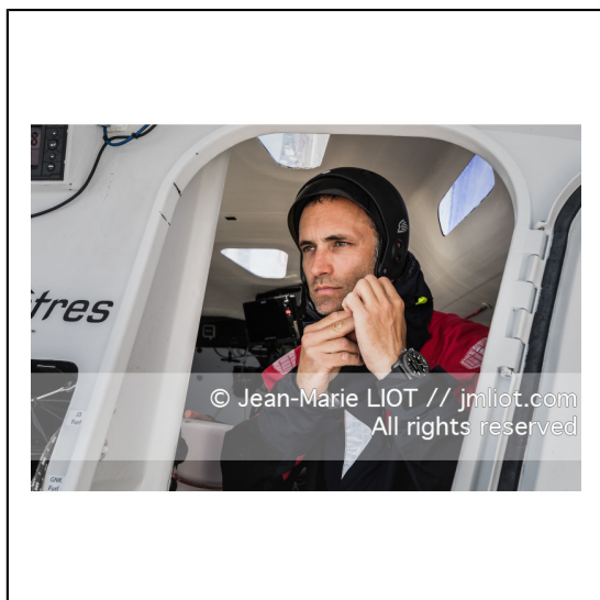
French solo sailor Fabrice Amedeo with Breitling watches, onboard his IMOCA Newrest-Arts & Fenêtres, in Quiberon Bay on April 18, 2018