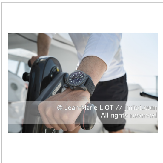
French solo sailor Fabrice Amedeo with Breitling watches, onboard his IMOCA Newrest-Arts & Fenetres, in Quiberon Bay on April 18, 2018