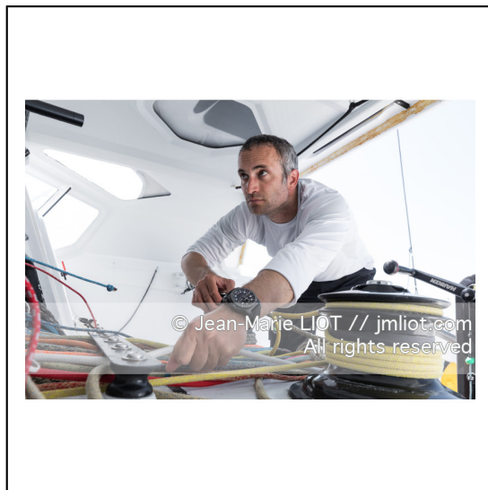
French solo sailor Fabrice Amedeo with Breitling watches, onboard his IMOCA Newrest-Arts & Fenetres, in Quiberon Bay on April 18, 2018