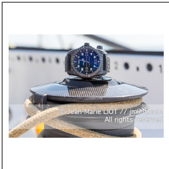
French solo sailor Fabrice Amedeo with Breitling watches, onboard his IMOCA Newrest-Arts & Fenêtres, in Quiberon Bay on April 18, 2018