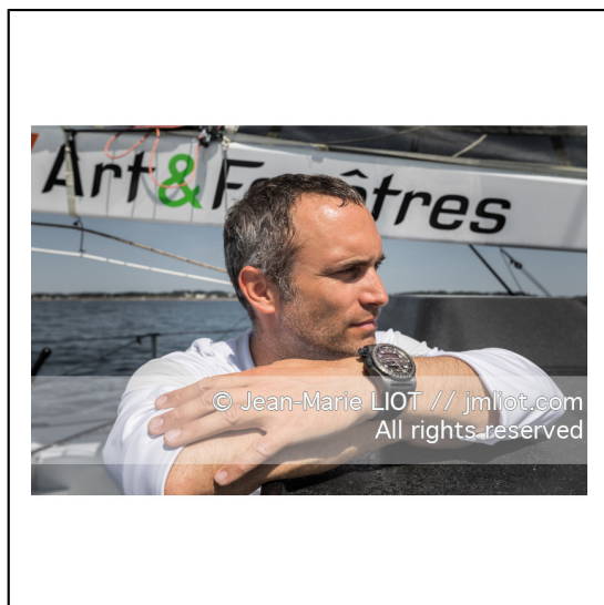
French solo sailor Fabrice Amedeo with Breitling watches, onboard his IMOCA Newrest-Arts & Fenêtres, in Quiberon Bay on April 18, 2018