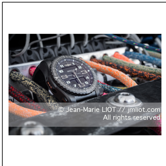
French solo sailor Fabrice Amedeo with Breitling watches, onboard his IMOCA Newrest-Arts & Fenêtres, in Quiberon Bay on April 18, 2018